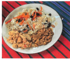
AFGHAN CHICKEN with RICE