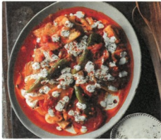
BORANI BANJAN (EGGPLANT)